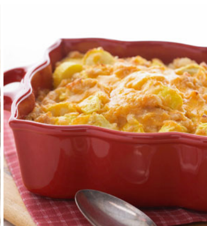
Summer Squash Bake