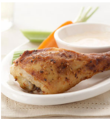
Oven-Fried Party Drumettes